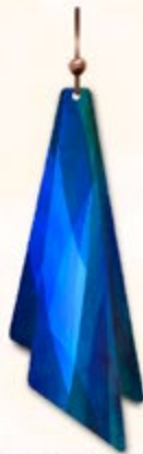
Q - Page 19 Drop Length 2 ½" $12.70 ea.