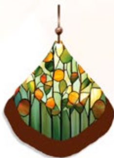
GE - Pages 18 & 19 Drop Length 1 ¾" $15.00 ea.