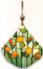
G - Page 6 Drop Length 1 3/8" $9.00 ea.