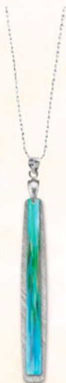
LSN-Matching Pendant 16" Silver Chain $19.00 ea.