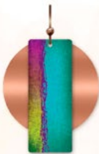
AE - Page 24 Drop Length 1 ¾" $13.50 ea.