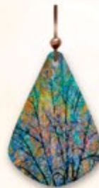
JE - Pages 12 & 13 Drop Length 1 1/2" $10.00 ea.