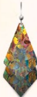
TT - Page 26 Drop Length 1 ¾" $16.00 ea.