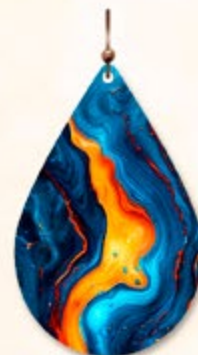
XB - Page 5 Drop Length 2" $12.00 ea.