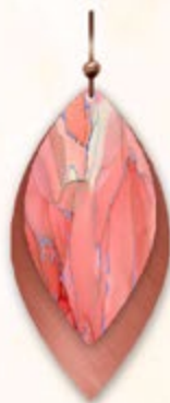
XA - Page 24 Drop Length 2" $14.00 ea.