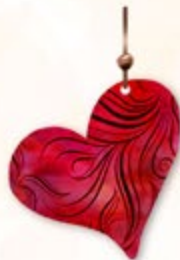
H - Page 11 Drop Length 1 1/8" $10.00 ea.