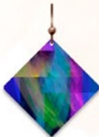
V - Page 27 Drop Length 1 1/2" $10.25 ea.