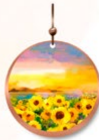
RE - Page 27 Drop Length 1 ½" $13.00 ea.