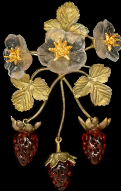
Style: 6227BZ Statement Brooch WP: $59

Cast bronze with a hand patina finish. Accented with flame-worked glass and a 24k gold finish. Known to be the first fruit that ripens during spring, strawberries are a tell-tale sign that warmer, sunny weather is on the horizon. This sweet fruit is the only one to feature its seeds on the outside, and is actually part of the rose family! From a fresh fruit salad to delicious strawberry shortcake, strawberries are rich in nutrients and are an integral ingredient in many delectable recipes.