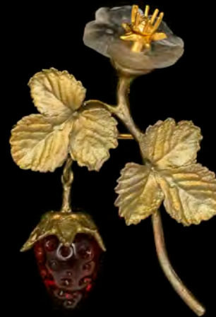
Style: 6226BZ Brooch WP: $38