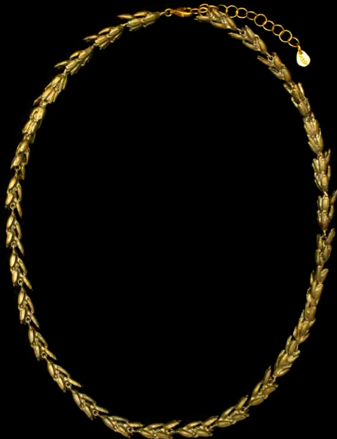
Style: 9418BZ Statement Necklace 17" adjustable necklace WP: $85

Domesticated over 10,000 years ago, this ancient grain is the source of an abundance of delicious foods. There are six classes of wheat, each having a preferred growing season of either winter or spring. The spring varieties of wheat are typically harvested during late summer. This versatile grain is a key base ingredient for many beloved baked and cooked goods, such as bread, pasta, and pastries.