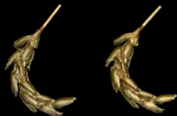
Style: 3666BZ Post Earrings WP: $24