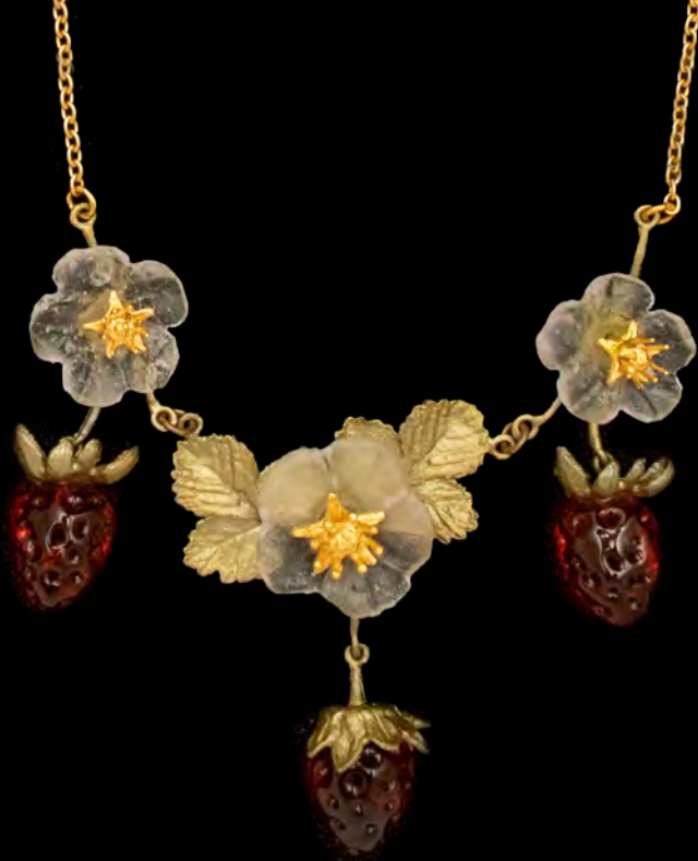
Style: 9425BZ Necklace 16" adjustable chain WP: $79

Cast bronze with a hand patina finish. Accented with flame-worked glass and a 24k gold finish. Known to be the first fruit that ripens during spring, strawberries are a tell-tale sign that warmer, sunny weather is on the horizon. This sweet fruit is the only one to feature its seeds on the outside, and is actually part of the rose family! From a fresh fruit salad to delicious strawberry shortcake, strawberries are rich in nutrients and are an integral ingredient in many delectable recipes.