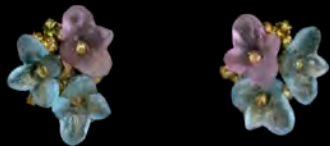
Style: 3663BZ Stud Post Earrings WP: $36