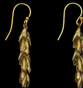
Style: 3667BZ Wire Earrings WP: $27