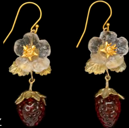
Style: 3670BZ Flower Drop Wire Earrings WP: $48