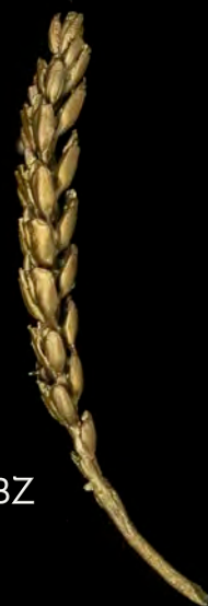
Style: 6225BZ Brooch WP: $32