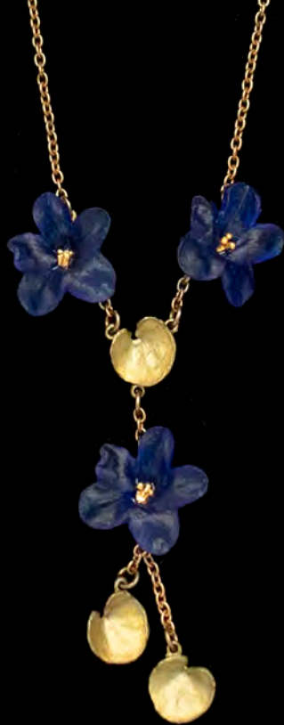
Style: 9408BZ "Y" Pendant 16" adjustable pendant WP: $49

These beautiful, delicate flowers appear to pop up in the most unexpected places during early spring, gifting us with the hope of warmer days to come. Native to North America, there are over 400 known species of violets, one of the most popular being the common blue violet. In Ancient Greece, violets were beloved and even considered a symbol of the city of Athens. These flowers can adapt to a variety of environments and never fail to surprise with their sporadic, vibrant blooms.