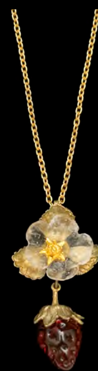
Style: 9423BZ Single Drop Flower Pendant 16" adjustable pendant WP: $37