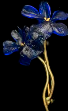
Style: 6220BZ Brooch WP: $32