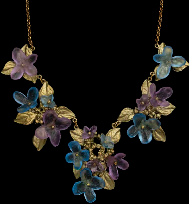
Style: 9414BZ Statement Necklace 16" adjustable chain WP: $89

As the seasons begin to warm and nature welcomes spring, bunches of hydrangea flowers blanket the quaint roads of Cape Cod. The Cape's sandy soil provides the perfect balance for the beautiful blue and purple hues of hydrangeas that dominate the majestic landscape. The effortless beauty that surrounds Michael's spring strolls down the country lanes not only brings him peace and fills his heart with joy, but provides wonderful design inspiration.