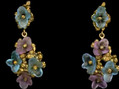
Style: 3664BZ Post Earrings WP: $46