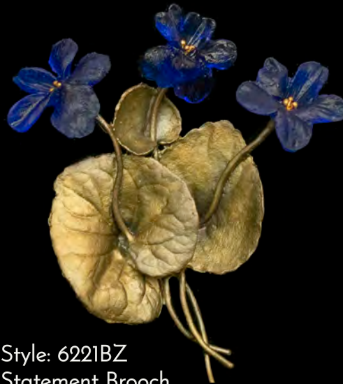
Style: 6221BZ Statement Brooch WP: $41