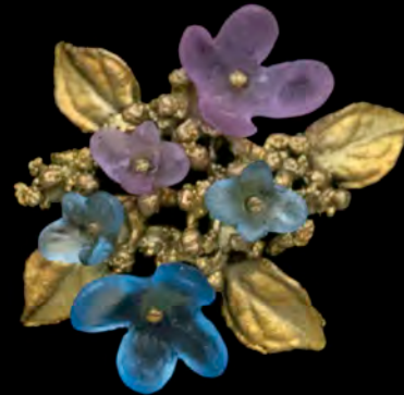
Style: 6224BZ Brooch WP: $39