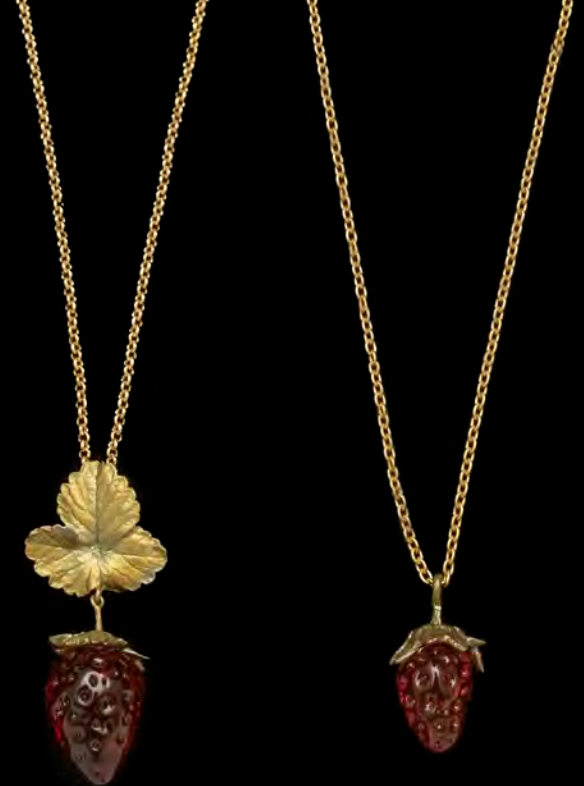
Style: 9421BZ Large Pendant 20" adjustable pendant WP: $36