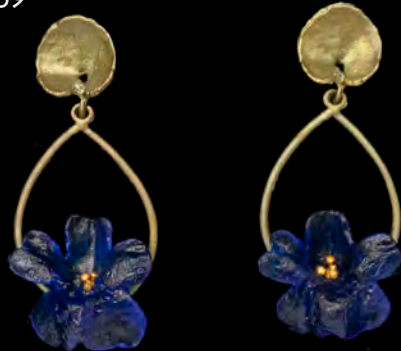
Style: 3655BZ Oval Post Earrings WP: $34