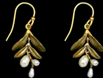
Style: 3661BZWP Dainty Wire Earrings WP: $27