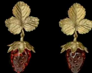
Style: 3669BZ Post Earrings WP: $44