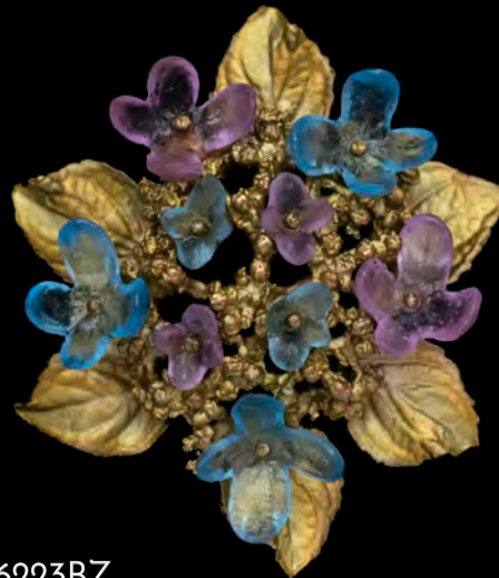
Style: 6223BZ Statement Brooch WP: $49