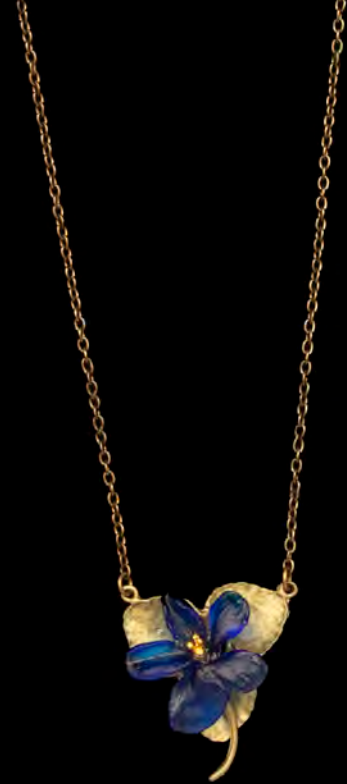
Style: 9410BZ Single Flower Pendant 16" adjustable pendant WP: $28