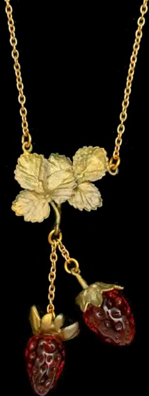
Style: 9424BZ Double Drop Pendant 16" adjustable chain WP: $45