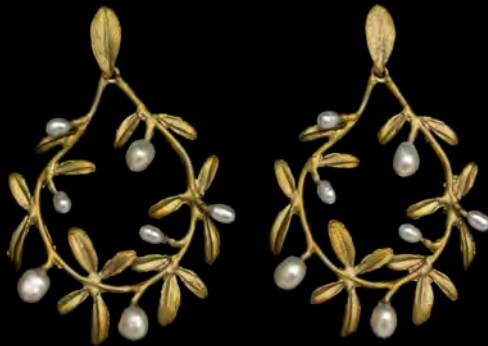
Style: 3658BZWP Circle Post Earrings WP: $39