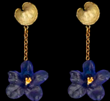
Style: 3657BZ Drop Post Earrings WP: $32