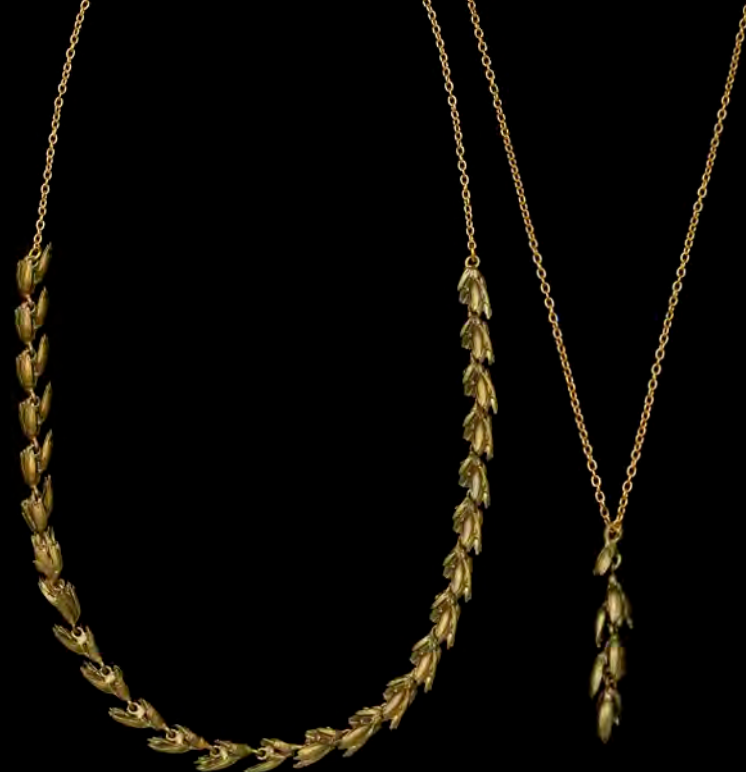
Style: 9419BZ Necklace 16" adjustable chain WP: $65