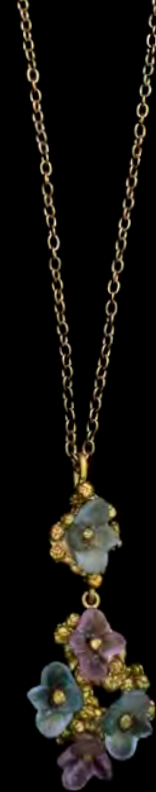
Style: 9417BZ Drops Pendant 16" adjustable pendant WP: $37