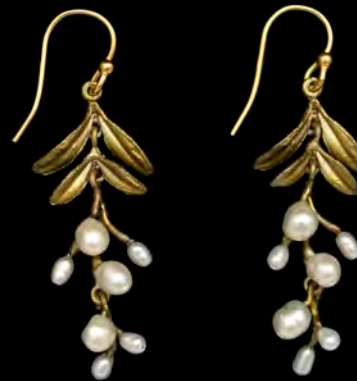
Style: 3659BZWP Wire Drop Earrings WP: $39