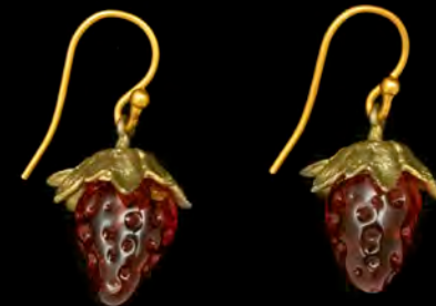
Style: 3668BZ Dainty Wire Earrings WP: $36