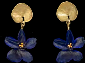
Style: 3656BZ Post Earrings WP: $33