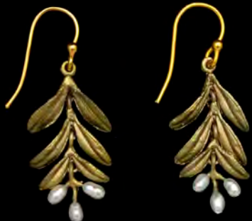
Style: 3660BZWP Wire Earrings WP: $30