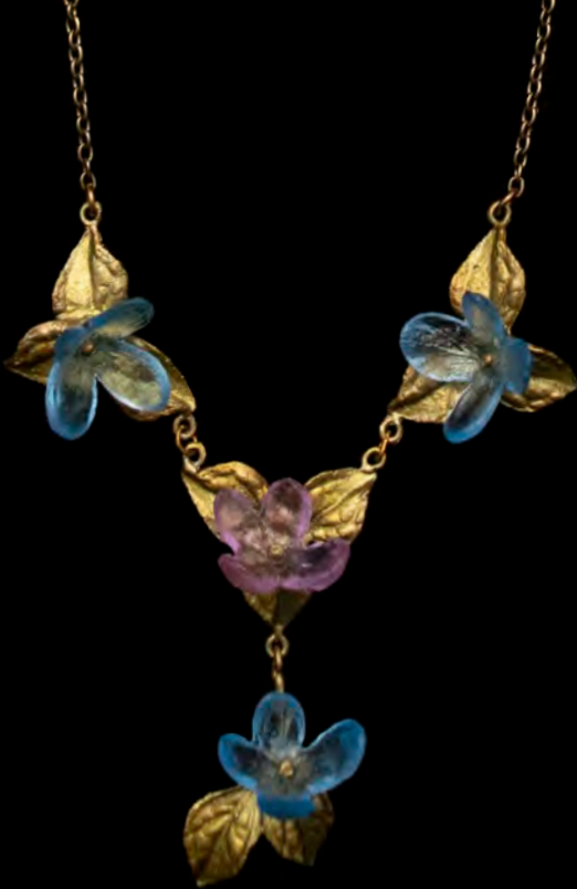
Style: 9415BZ "Y" Pendant 16" adjustable pendant WP: $48

As the seasons begin to warm and nature welcomes spring, bunches of hydrangea flowers blanket the quaint roads of Cape Cod. The Cape's sandy soil provides the perfect balance for the beautiful blue and purple hues of hydrangeas that dominate the majestic landscape. The effortless beauty that surrounds Michael's spring strolls down the country lanes not only brings him peace and fills his heart with joy, but provides wonderful design inspiration.