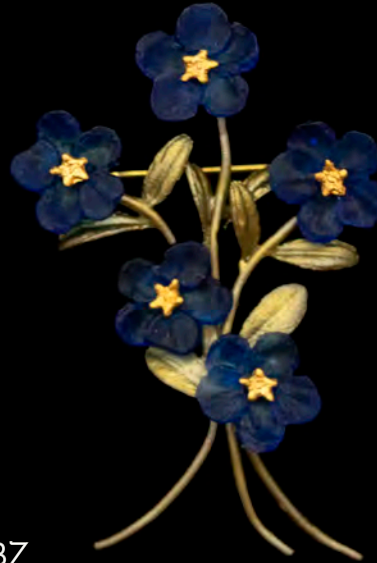
Style: 6222BZ Blue Violet Brooch WP: $41