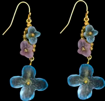
Style: 3665BZ Wire Drop Earrings WP: $39